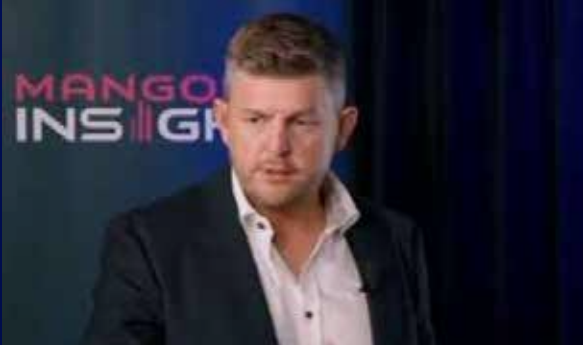
Presentation at the investor day at Mangold in Stockholm