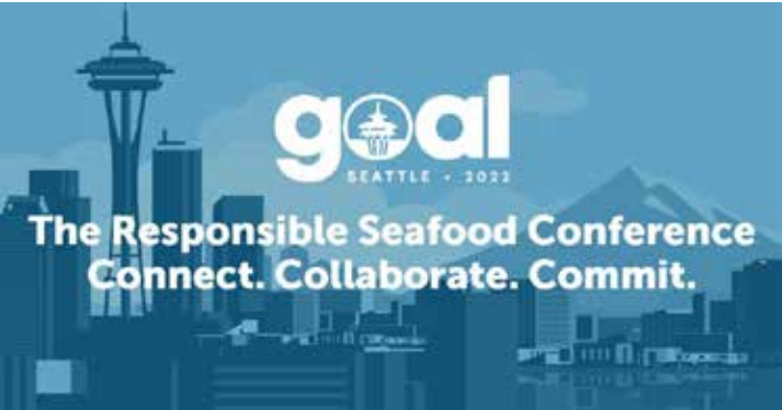
Presentation in Seattle at the GOAL conference