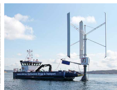
Top: Artist's rendition of SeaTwirl S2. Below: SeaTwirl S1, grid connected since 2015.